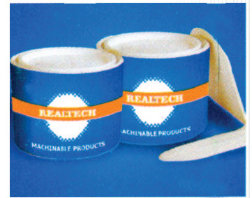
POLY STEEL (HT)