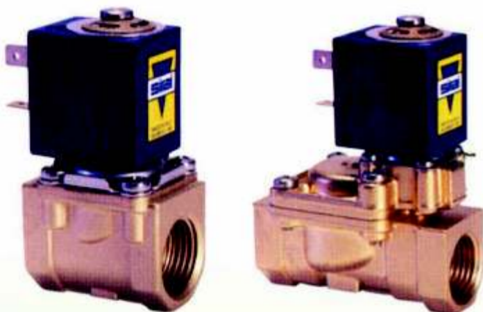
GENERAL PURPOSE VAVES