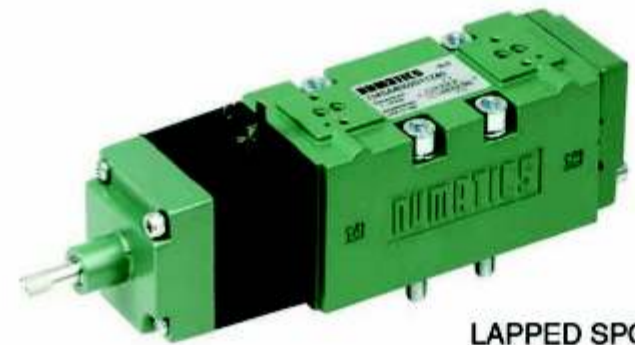
LAPPED SPOOL AND SLEEVE VALVES