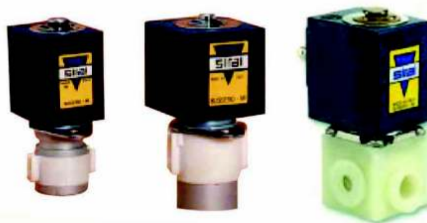
DRY SOLENOID VAVES